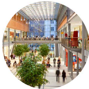
RETAIL, MARKETING, ADVERTISING

communicate with their customers in various contexts, as the interaction through the gaze creates a strong engagement and low entry barrier being highly intuitive and a natural way of interacting with the device, and as it allows to present targeted content based on the users interests.