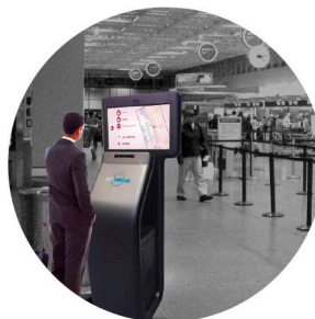
INFO POINT IN PUBLIC ENVIRONMENTS